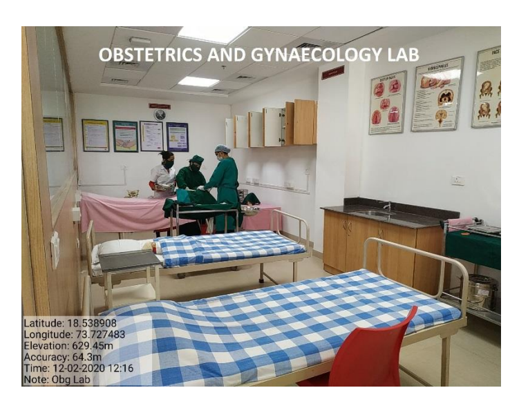
OBSTETRICS AND GYNAECOLOGY LAB