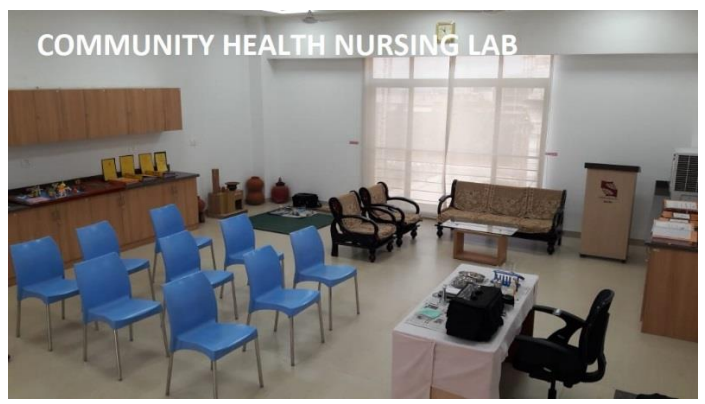
COMMUNITY HEALTH NURSING LAB